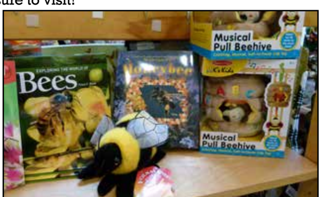
A sample of the themed merchandise featuring local honey and products about bees.

Featuring new nature-inspired items and many local goods from New Hampshire and Vermont. Plus, a whole new look and layout to the store. Be sure to visit!